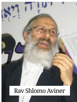
Rav Shlomo Aviner

The Ibn Ezra offers a different take on our pasuk . The Ibn Ezra suggests that the words uvyom simchatchem- represent an instruction to sound the chatzotzrot upon those joyous