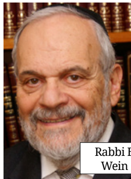
Rabbi Berel Wein zt”l

The following is a story that Rabbi Wein told over many times and that can influence